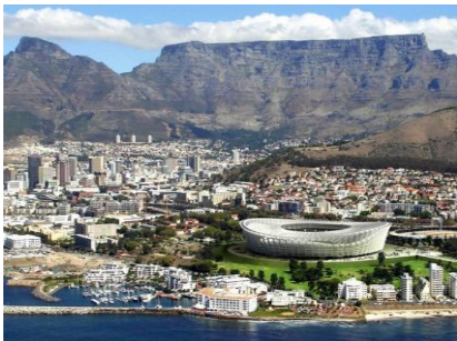
TABLE MOUNTAIN AND THE SEAL ISLAND TOUR (Code: CDT05)